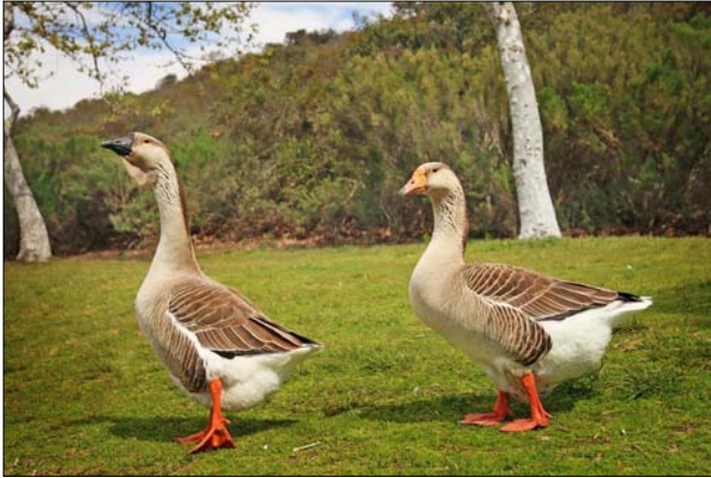
“The Royal Walk” in Rancho Buena Vista Park