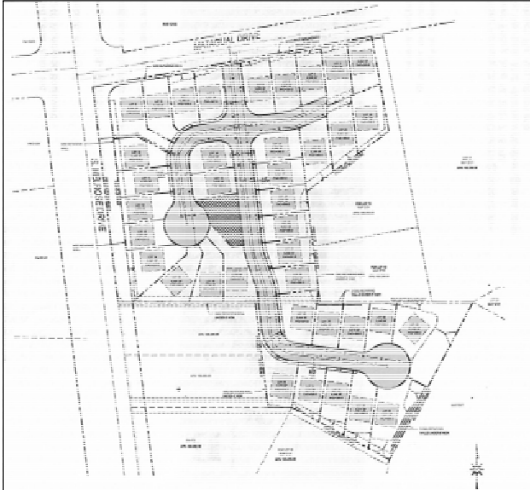
Original layout for True Life project