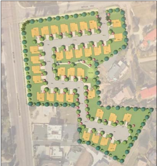
Revised project layout

True Life Companies invited Matagual-area residents to a meeting on November 26 to discuss a revised layout for the Matagual-Melrose project.