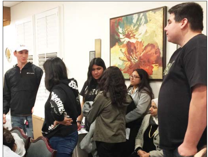
A group of Rancho Buena Vista seniors contributed to the discussion.

The consultants will use the information to develop a master plan for Vista's sheltered and unsheltered population, for presentation to the City Council, possibly in June.