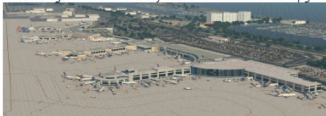
2009 - Construction of the new CRQ new terminal